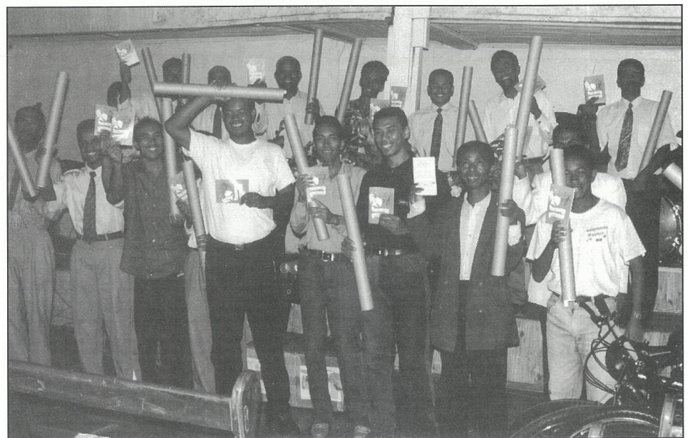
Preachers in Madagascar receive their bicycles and Heart of Man charts.

Parts of Madagascar are so inhospitable and difficult to reach and it took the generosity of a Johannesburg businessman to sponsor three helicopter flights into the rain forests on the south eastern side of the island. In time, wherever there are people on the island of Madagascar, they'll hear the good news. At the time of writing this news report, more heart of man charts and bicycles are being taken to the people of Madagascar and the Lord has even laid on free transport with a cargo ship which regularly sails between Durban and Taomasine Tama Tave, Madagascar.